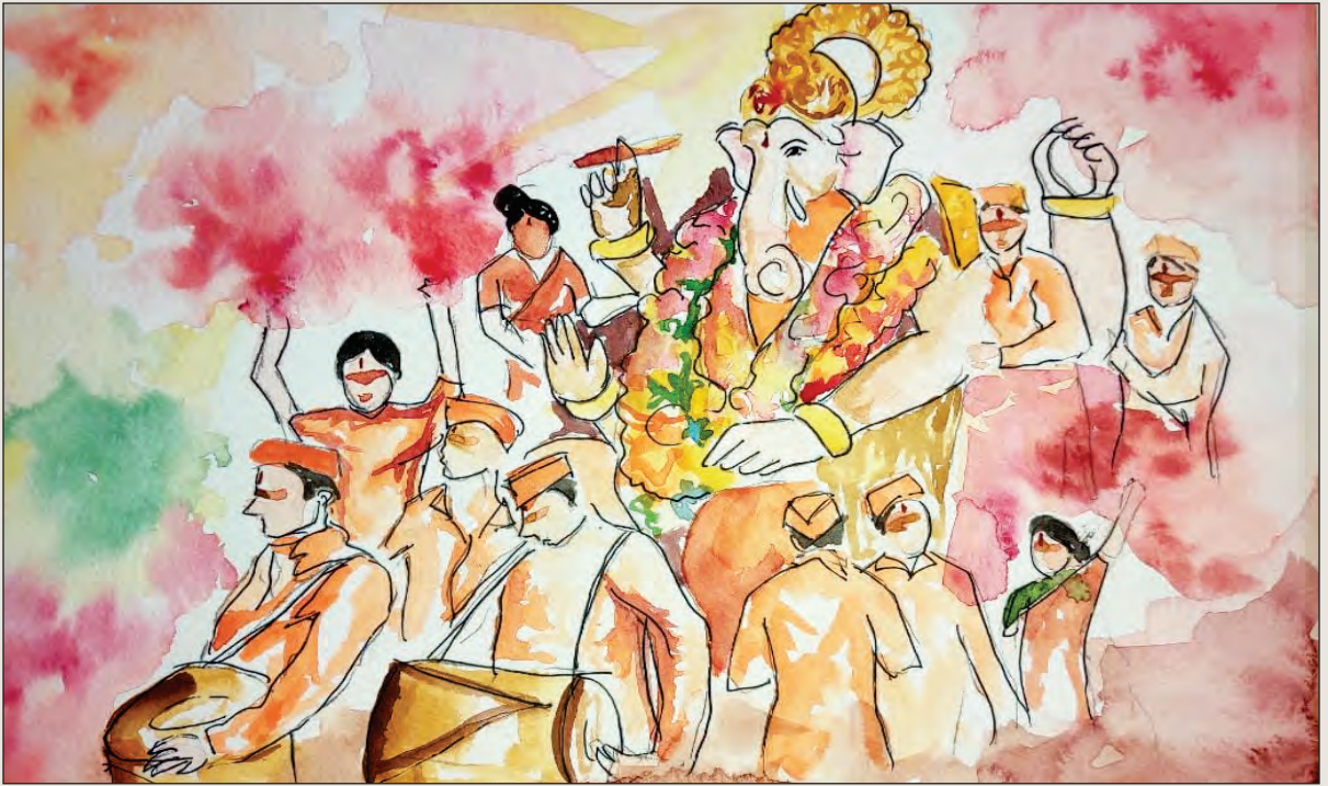
Taniya Shekhawat (Alumna), Water Colour Painting