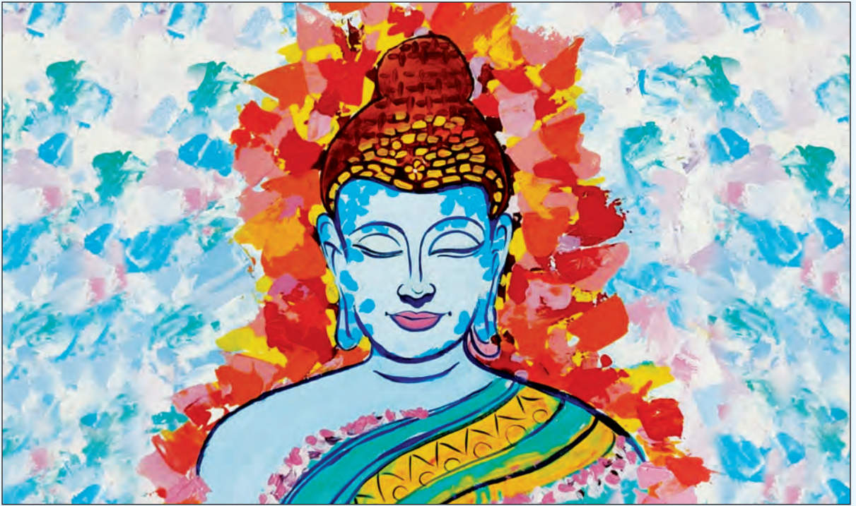
Anushka Acharya XII, Acrylic on Tiles