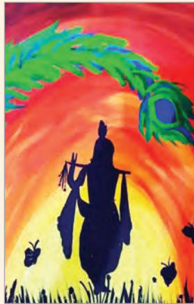
Bhavya Khandelwal (VIII) Poster Colour