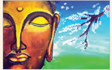
Harit Sengupta (X) Acrylic on Canvas