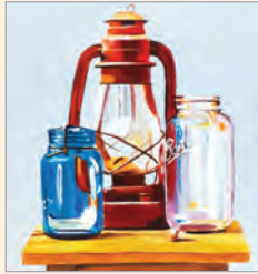
Rupal Choudhary (Alumna) Still Life with Oils