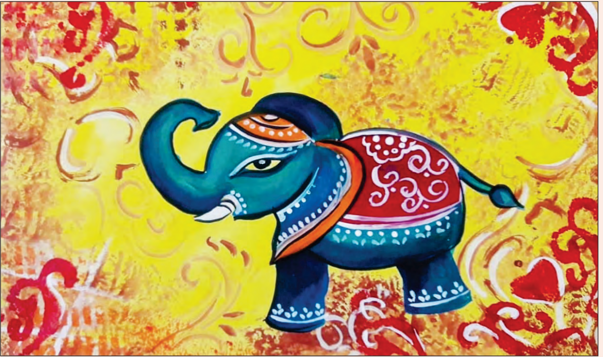
Nehit Yadav XI, Texture Painting