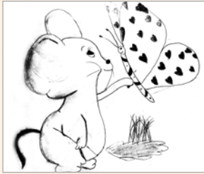
Kashvi Jha (IV) Sketch